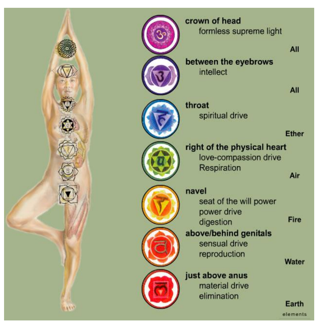
http://handsonhealer.webs.com/chakras.jpg, 2010, chakras and what are they ?diaccess tgl 23 April 2013.

Chakra is the energy center that flows from one level to another. Spinning constantly, back and forth, like in and out of the breath, spin like a fan, clockwise. This energy is the life force of the whole body. According Hindu philosophy humans have 7 major and 21 minor Chakras. Interesting enough, for Chinese acupuncturists we have hundreds of thousands of minor body Chakras viewed by many as important healing points. These run through the human body in regular energy patterns and waves, being located both inside and outside the body.(http://handsonhealer.webs.com/chakra s.ipg, 2010, chakras and what are they? access on April 23st 2013). According to Hindu philosophy the number of major chakras in the human body is 7, and 21 minor chakras. Meanwhile, according to chinese acupuncturists there are hundreds of thousands of minor chakras associated with centers or acupuncture points as the starting